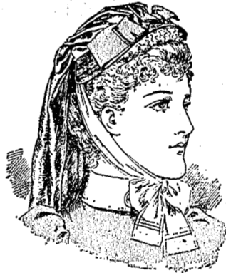
The "St. Bride's" Bonnet. Made of fine Straw with Lace and ruching, and trimmed with Ribbon, and long Silk Gossamer Fall. In black and colours, 12/6 each. Without Fall, 9/6; also The "St. Clare" Bonnet. 6/11 complete.