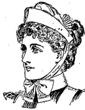
The New "Sister Dora" Cap. Made of washing Cambric, with draw strings. Can be washed as easily as a handkerchief. 1/-. Without strings, 10½d.