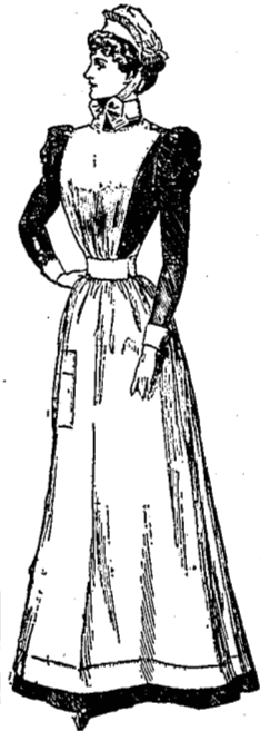
The "Rena" Apron. Made of linen finished Cloth lock-stitch throughout, 2/6 each. In two sizes, 36 in. & 39 in. from waist to hem.

PATTERNS FREE OF THE New Washing Materials for Nurses' Dresses,